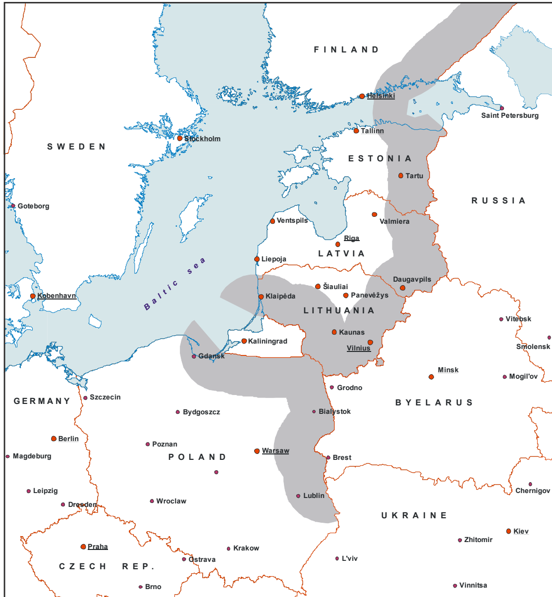
Buffering zone necessary to protect fixed-satellite service of Russia and Belarus in the 3.4-3.6 GHz band